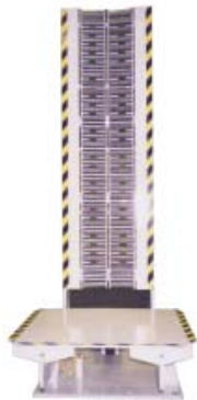
INFEED ROLLERS - FLAT PLATE DISCHARGE