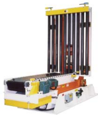
INFEED BELT - SIDE CDLR DISCHARGE