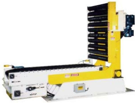
INFEED BELT - STRAIGHT CDLR DISCHARGE