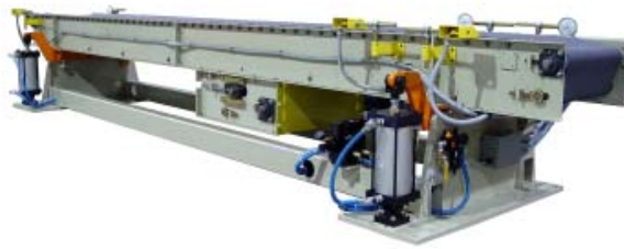
EJECTING TILT CONVEYOR