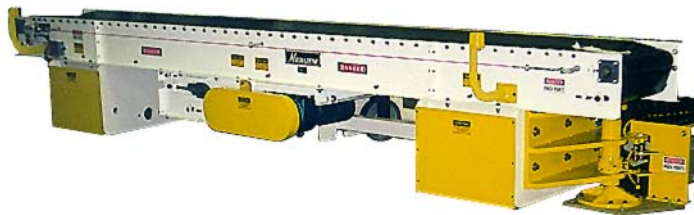
END SWING CONVEYOR