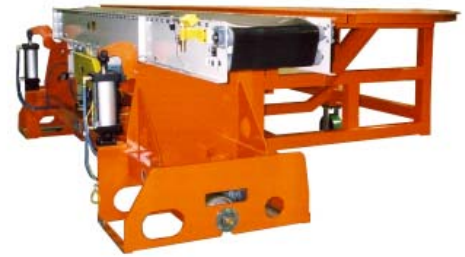
CENTER TURN CONVEYOR WITH TILT